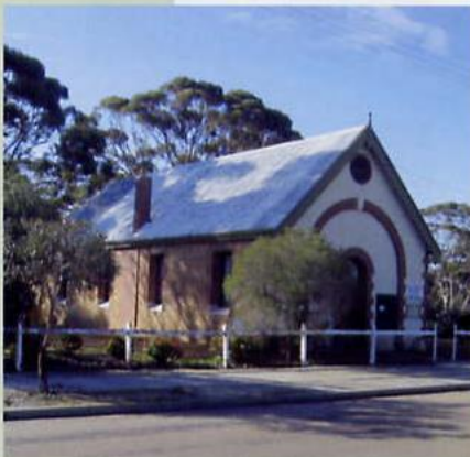
Kellerberrin Folk Museum.

3. Old Fire Station, built from local granite in 1914 it is one of only two remaining purpose built fire stations opened during the decade 1910 - 1919. It currently houses the library and Telecentre.